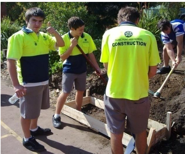
Yr 12 Construction hard at work.

Well what a flying start to the year it has been, Year 12 well into their studies of their HSC year, Year 11 starting the preliminary course and the junior years starting construction of many interesting projects that will further develop existing practical skills.