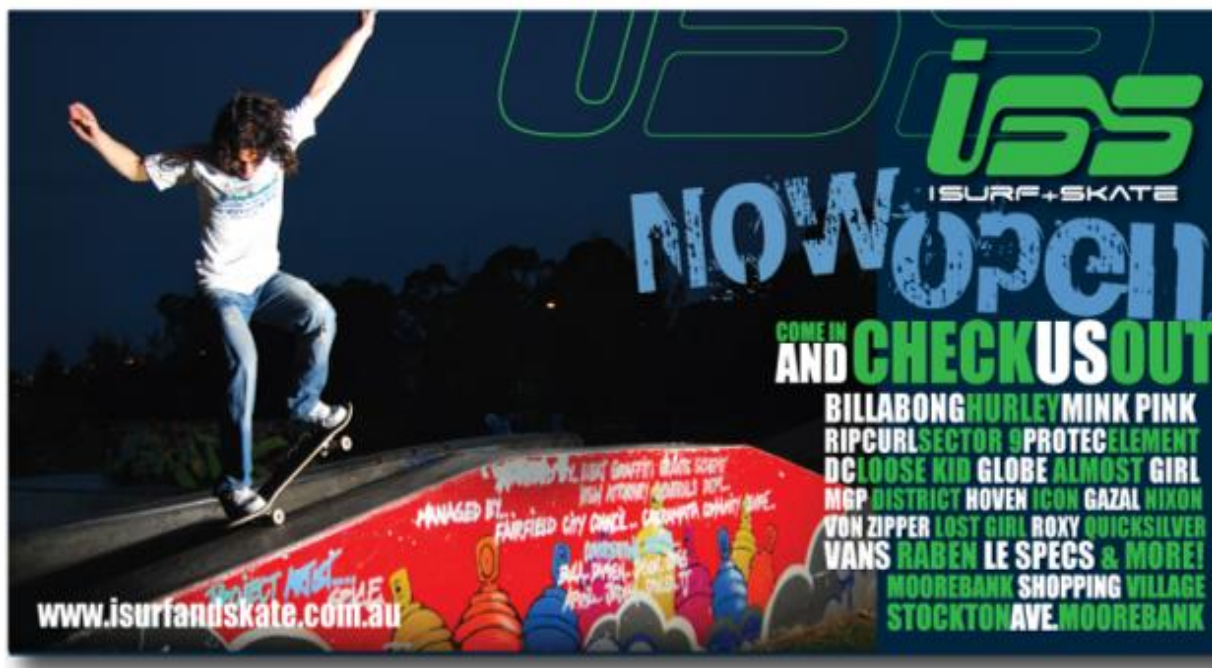
Shop 32 Stockton Avenue, Moorebank Shopping Village