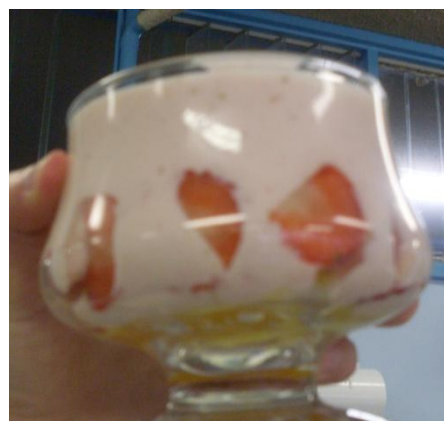
Paige Kovacs- Orange and Strawberry Yogurt