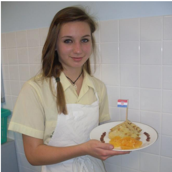
Chelsea Mihaljek Palacinke Pekmezom ( Croatian Pancakes)