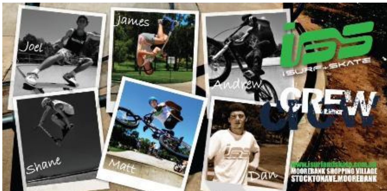
Shop 32 Stockton Avenue, Moorebank Shopping Village