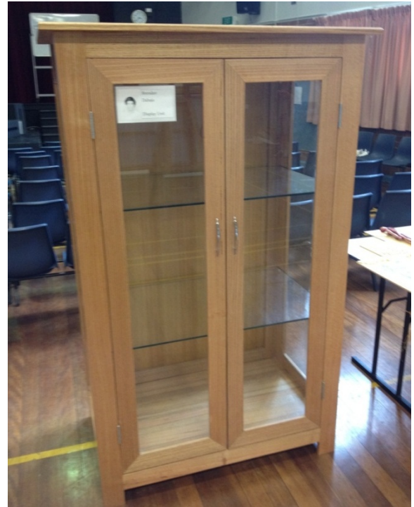
Display Cabinet Brendan Dabaja

As you can see there has been a lot of hard work and effort put into these projects and folios and all students are to be congratulated on the effort and application that they have displayed.