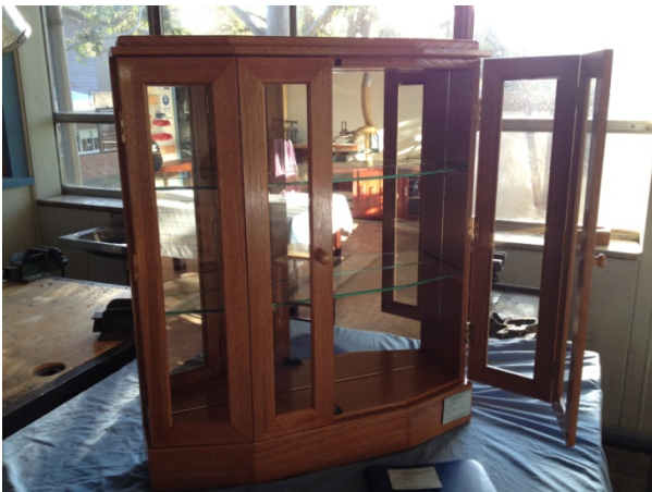
Display Unit Simon Manoulios