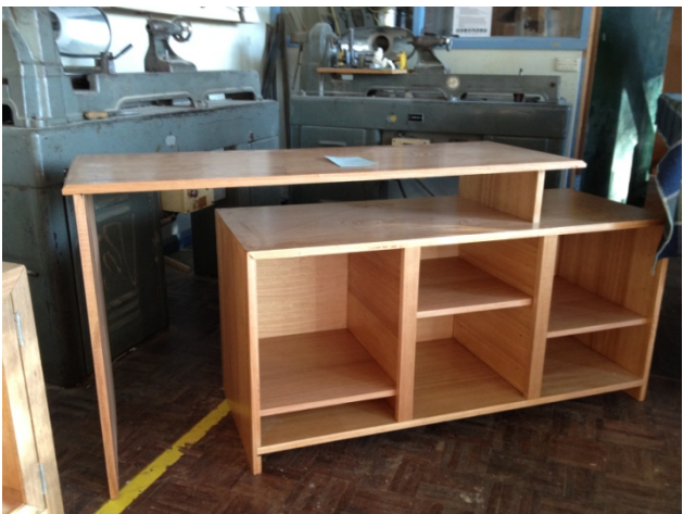
Entertainment Unit Jake Kercheval