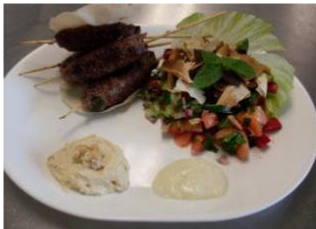
Kafta with Fatoush Salad and Lebanese dips (Lourance Haddad)

With everyone making their own dishes, the benches were covered with ingredients and equipment, which made it interesting, to say the least. In the end, everyone completed their dishes to a high standard, everything looked delicious and tasted great too!