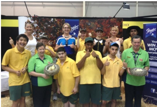
We even had our photograph taken with the baby chicks.