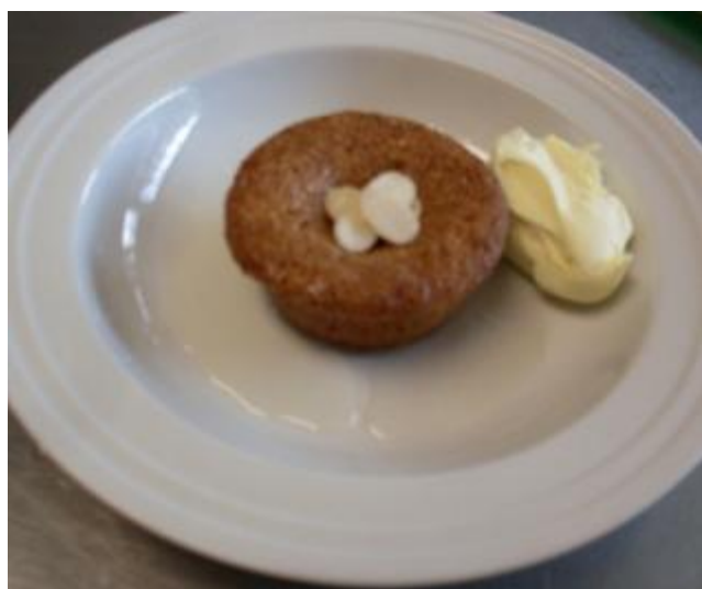
Individual Lemon Polenta Cakes with Mascarpone (Amy Ahern)