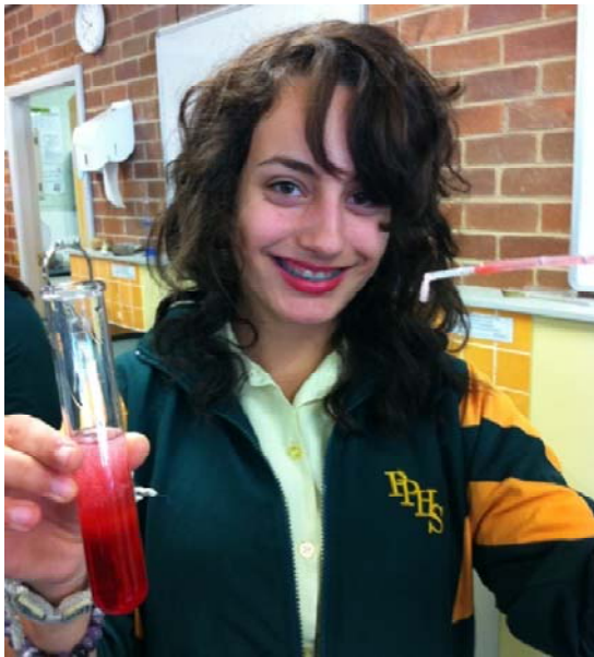
Students in 100 and 10R extracting DNA from strawberries and kiwi fruits.