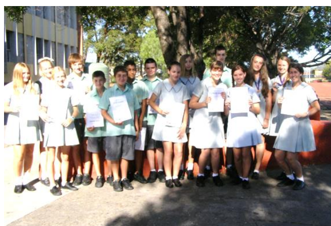
Winners of the Gold and Platinum certificates and Medals